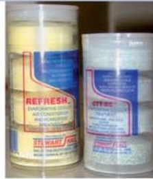
Scale & Algae Tablets