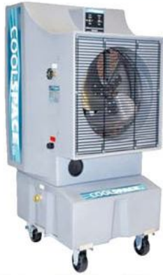
(shown with optional 16-inch wheel base accessory)