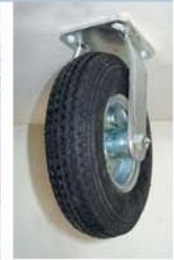
Pneumatic 8" Tires