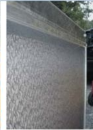
Pad Filters & Lint Guards