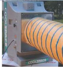
Flexible Ducts Kits