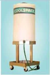
70 Gallon Water Tank